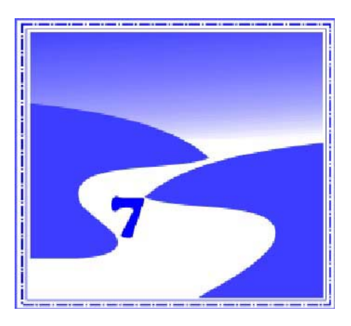
Chapter 7: Financing Options

As discussed in Chapter 2, after preparing a proforma income statement and filling out a cash flow statement, you should know if you need additional funding to pay your business bills.