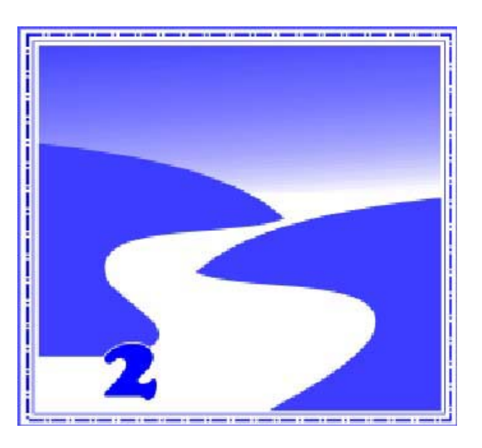
Chapter 2: The Business Plan

After you complete your feasibility study and decide to proceed with your business opportunity, your next step is to develop a sound business plan. Before you start, however, keep in mind the following general principles.