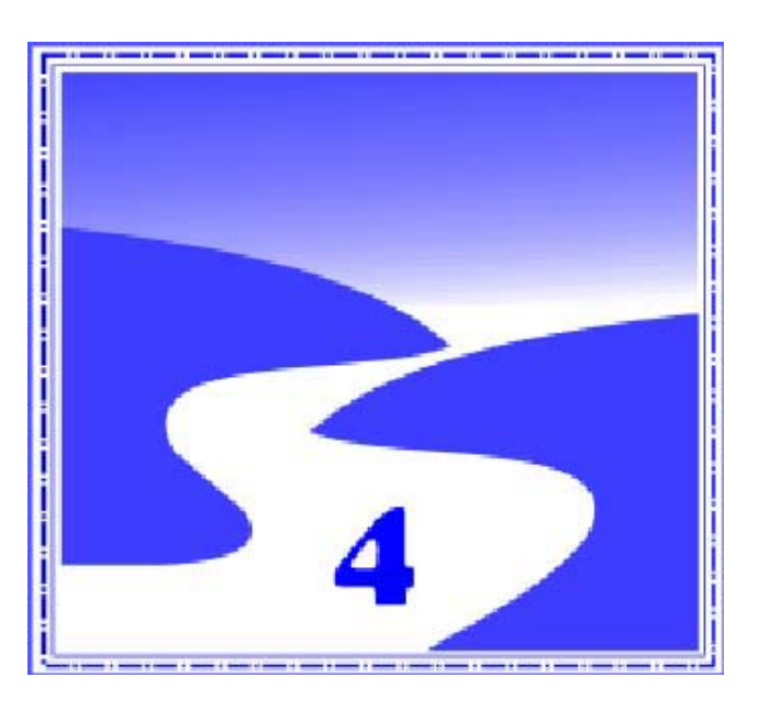
Chapter 4: Legal Issues

The next step in starting your business is to select the best legal form for your new business venture. The choices include sole proprietorship, partnership, limited liability partnership, C Corporation, S Corporation and limited liability company.