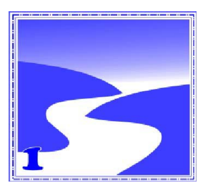
Chapter 1: The Feasibility Study

The first step on your road to starting a business is the feasibility study. This first step helps you, the prospective business owner, determine the practicality and viability of your business idea. After completing the feasibility study, you will have an indication of market opportunity and growth potential. You want this information now, before you risk valuable time and money.