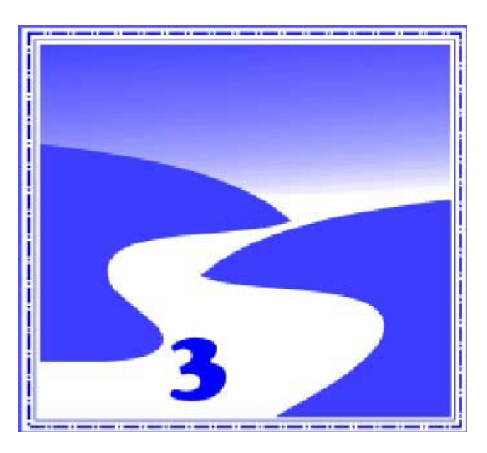
Chapter 3: Cash Flow Requirements

Now that you've identified your product or service, assessed your customers and competition, and established sales goals using a marketing/advertising plan, it's time to test these ideas by converting them into numbers. The test is called a cashflowanalysis .