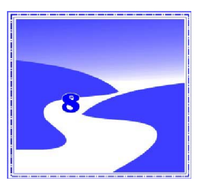
Chapter 8: Tax Responsibilities

One of the responsibilities of starting or operating a business is determining the type of taxes your business should pay. Many federal, state and local taxing authorities exist and you should consult with several agencies to obtain complete information. This booklet cannot present an entire list of potential taxes, but a summary of major state and federal organizations and key taxes is presented below. Local taxes are not addressed because each locale holds different taxing requirements. To clearly understand your tax liabilities, call taxing authorities in your area.