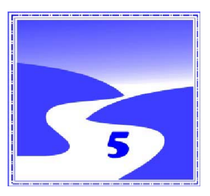
Chapter 5: Permits

During your feasibility study you considered the various licenses and permits you may require to operate your business. The Texas Marketplace, Business Information and Referral Specialists at the Texas Department of Economic Development can assist you in obtaining the appropriate permits to operate within Texas.