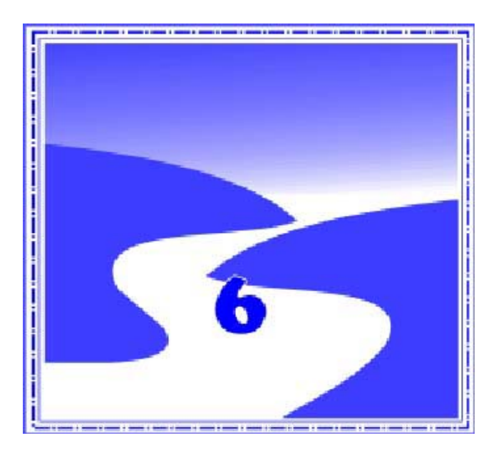
Chapter 6: Employee and Contract Labor

When your business begins to grow, you may need to expand your staff. Your first questions will be: Do you hire full- or part-time employees or do you hire subcontractors to perform specific projects on an as-needed basis?